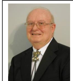
Ted Kennedy, AL